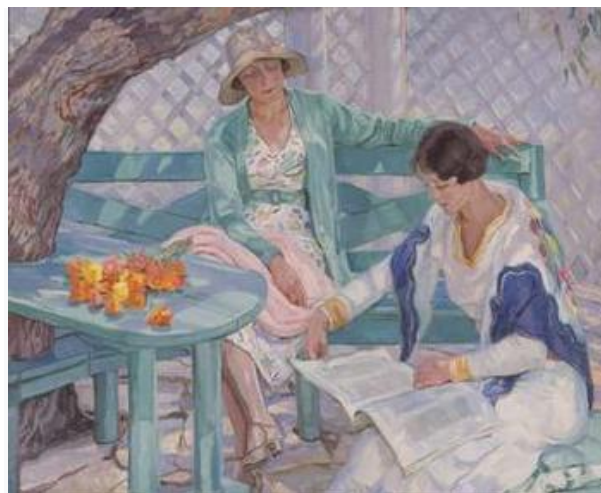
The Summer House , painted circa 1933, is one of Rix Nicholas's best known works, but the artist herself was ambivalent about it and never showed it publicly.