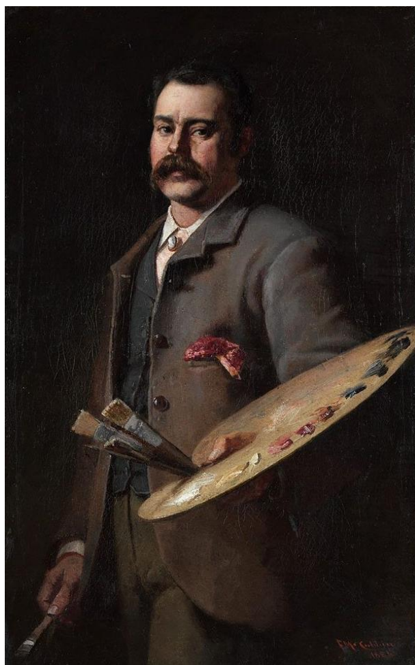
Self-portrait of Frederick McCubbin, member of the Heidelberg School and Rix Nicholas's first major influence

singer who performed with the Ballarat Harmonic Society. [5] In addition, she had a studio in Melbourne's Flinders Street , and a committee member of the Austral Salon, "a meeting place for intellectual women interested in the fine arts." [4] She painted in an academic style , generally choosing still lifes and flowers as subjects, though she painted some large landscapes in the Beechworth region. [6]